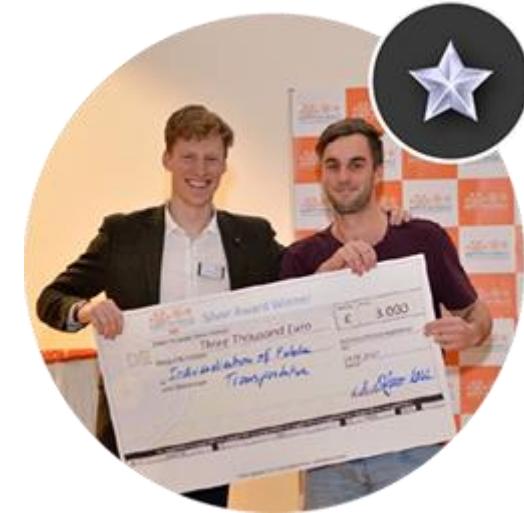
Silver Award 3.000 EUR)