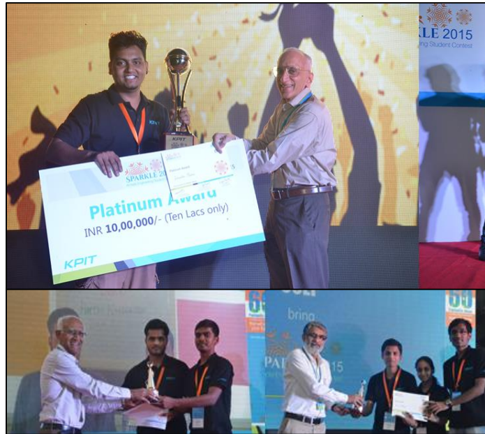
KPIT Sparkle 2015