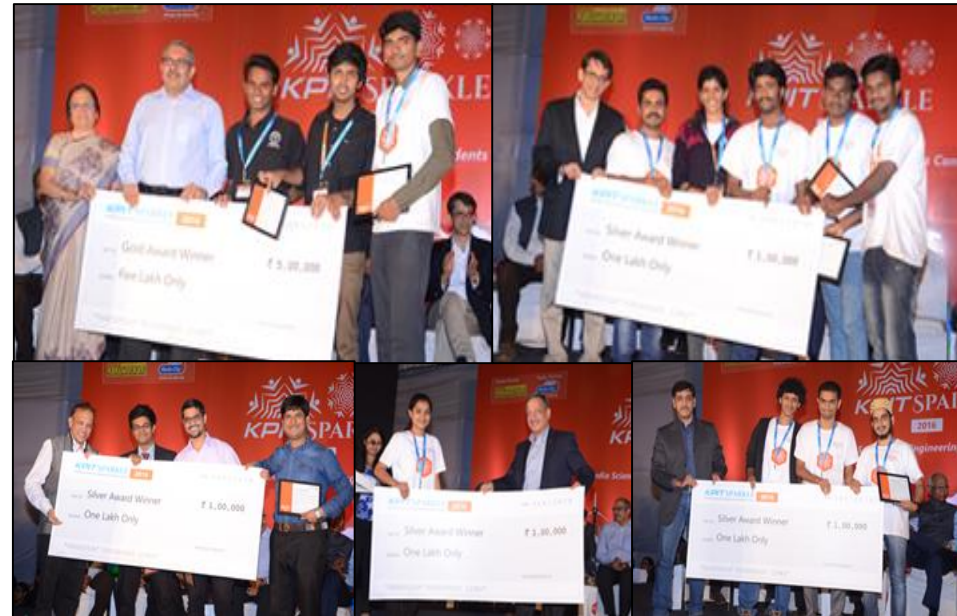
KPIT Sparkle 2016