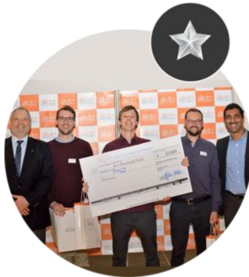
Platinum Award (10.000 EUR)