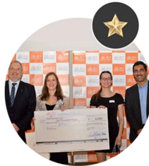
Gold Award (6.000 EUR)