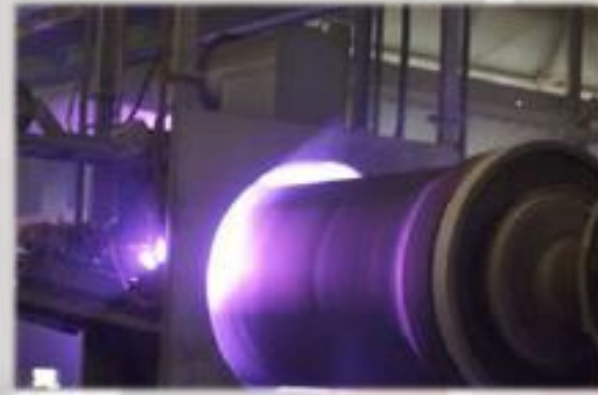
Ductile Iron Pipe