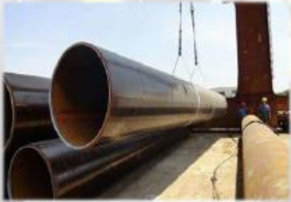
Large Diameter SAW Pipe