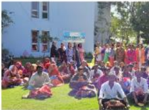
BLANKET DISTRIBUTION DURING MAKAR SANKRANTI