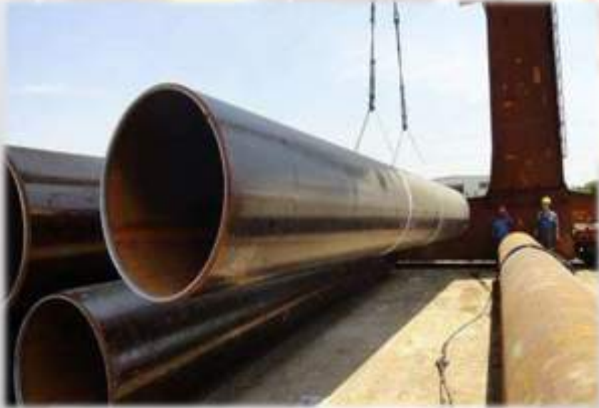
Large Diameter SAW Pipe