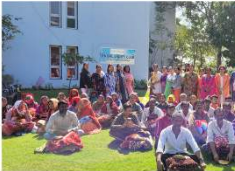
BLANKET DISTRIBUTION DURING MAKAR SANKRANTI