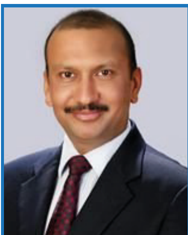
Sri Navin Mittal IAS

Commissioner, Collegiate Education & Department of Technical Education, Govt. of Telangana.